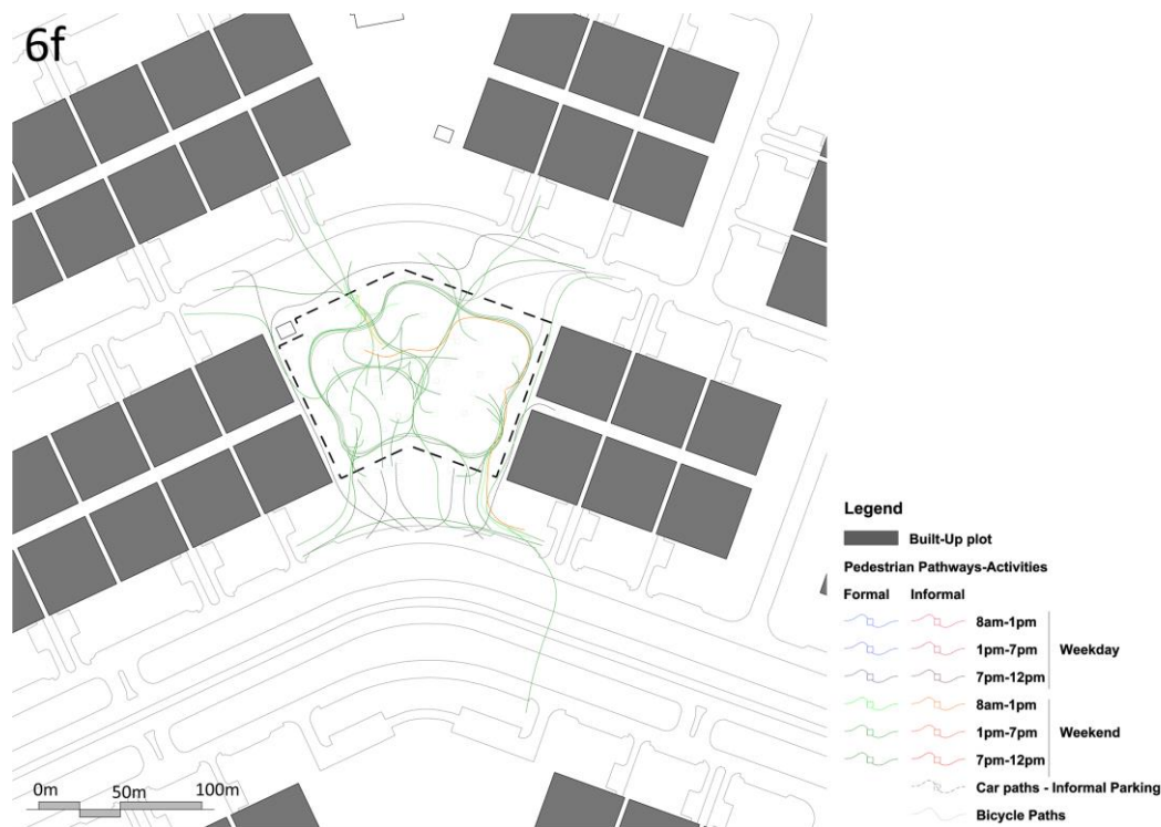
Figure 4: Mapping of pathways and activities of public space users.