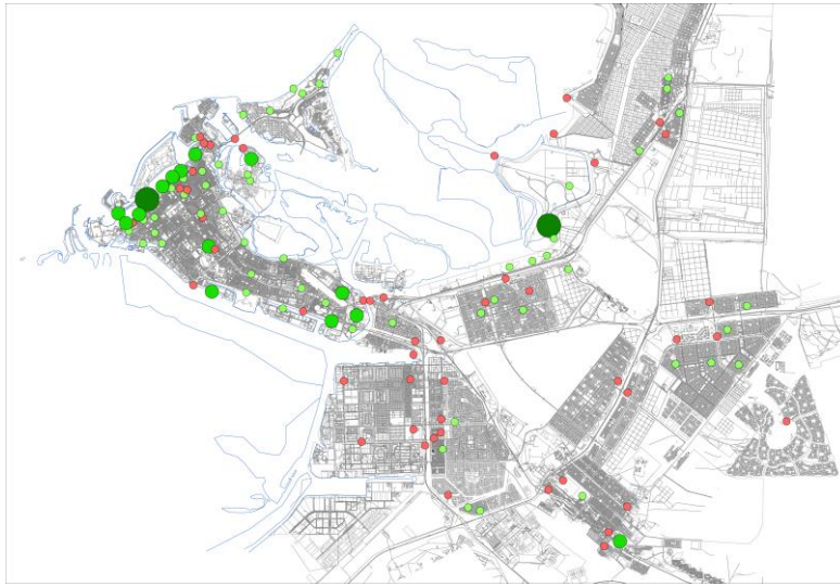
Figure 1: Map of public spaces in Abu Dhabi. Formal spaces are in green (sized after their importance/impact) and informal spaces are in red.

For addressing issues related to observations' time management and comparability without compromising its scientific principles, the city was divided in seven zones with distinct morphological characteristics and ethnic distribution (in numerical order): the downtown superblocks, the mid-island low-rise villas, the institutional Maqta channel, Khalifa City, the industrial suburbs, the desert sprawl suburbia and the waterfront expatriate free zones (figure 2).